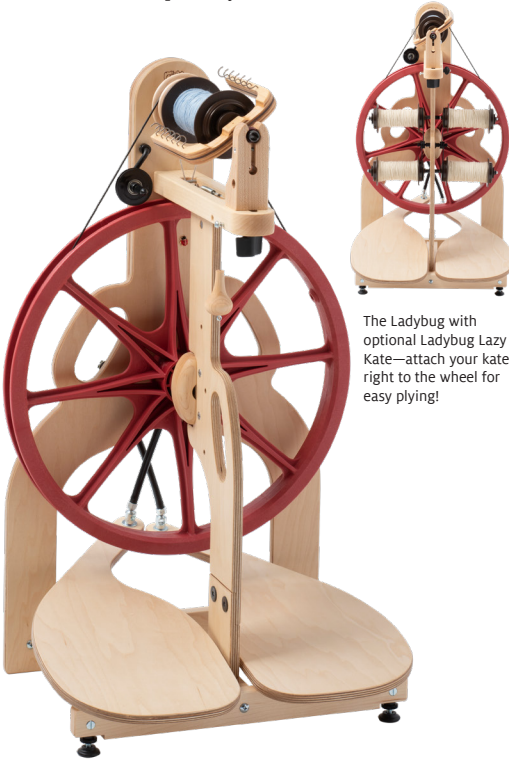
The Ladybug with optional Ladybug Lazy Kate—attach your kate right to the wheel for easy plying!

Friendly to entry-level and seasoned spinners alike, our Ladybug spinning wheel is easy to treadle, easy to take with you...and as cute as a bug! With solid Schacht construction and an eye-catching design, the Ladybug is both functional and charming. Made of maple plywood and solid maple, the Ladybug sports integrated carrying handles. Its attached lazy kate is available separately.