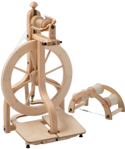
The Matchless offers multiple spinning modes and a wide range of ratios.

Responsive, versatile, comfortable, our Matchless Spinning Wheel combines contemporary styling with an integrated blend of design and function. In every detail, from our individually balanced flyer to fine-tuning tensioning, the Matchless Spinning Wheel is designed to give the highest performance in a wheel that is both light treading and comfortable to use.