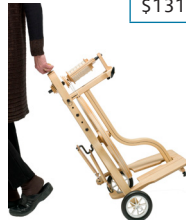
Add a Matchless Cart for portability.