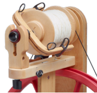
The Ladybug with Bulky Plyer Flyer (also available for Sidekick, Flatiron, and Matchless spinning wheels).