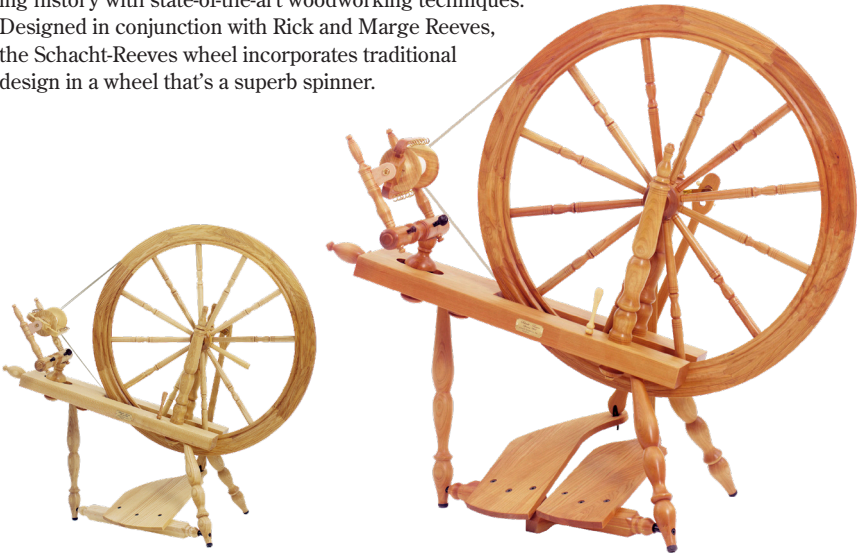
The Schacht-Reeves spinning wheel gives you a wide range of ratios to make your spinning smooth and easy. Left: 30" ash single treadle. Right: 30" cherry double treadle.