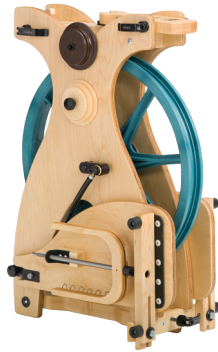
The Sidekick folding travel wheel folds up easily so it can go where you want to go.